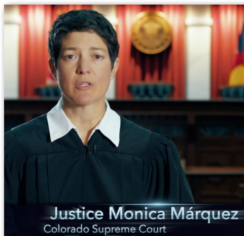
The video was posted on the Colorado Supreme Court website on February 22, 2018: https://www.youtube.com/watch?v=sMYRFAy2-xo&feature=youtu.be .